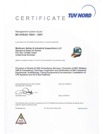
OHSAS 18001 CERTIFICATION