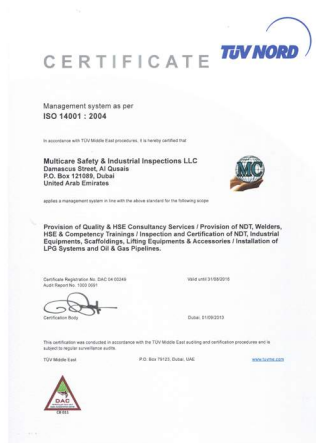
ISO 14001 CERTIFICATION