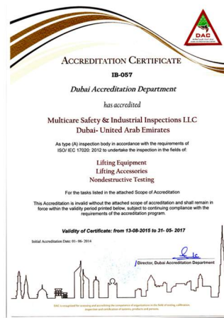
DAC ACCREDITATION CERTIFICATE Lifting Equipment & Accessories