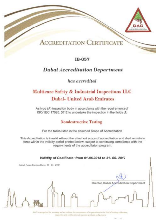
DAC ACCREDITATION CERTIFICATE Non Destructive Testing