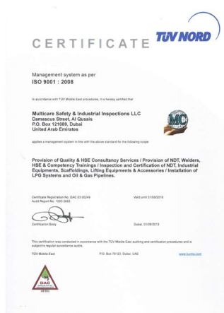
ISO 9001 CERTIFICATION