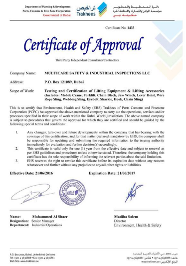
TRAKHEES APPROVAL CERTIFICATION